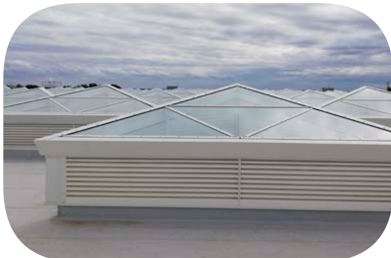
Pilkington Activ Optilam ™

Apart from the above-mentioned combinations, other configurations are possible (e.g. Pilkington Activ Suncool Optilam ™).