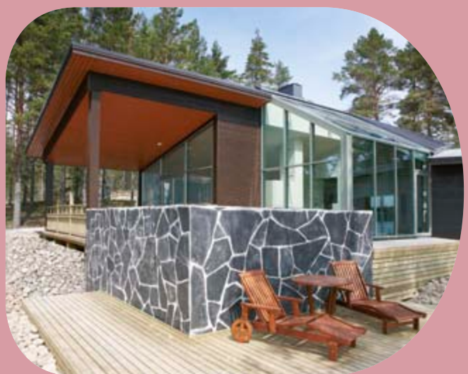
Pilkington Activ Suncool™ 70/40