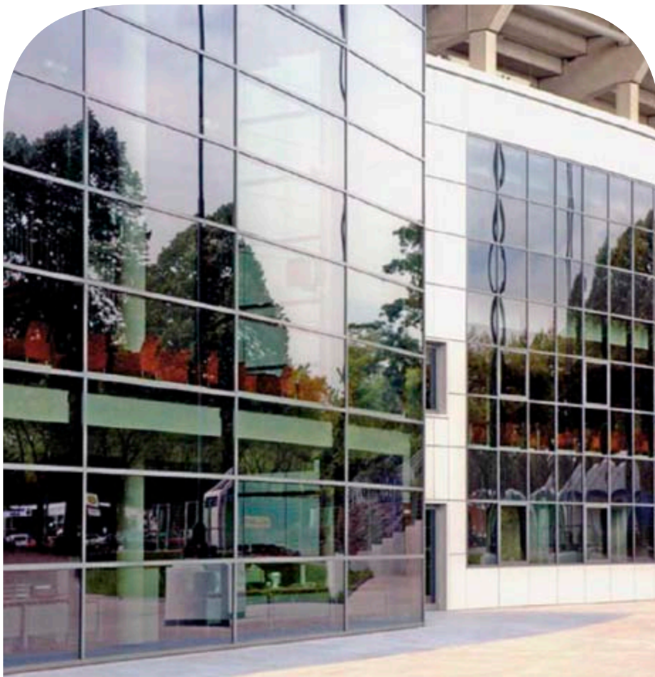
Pilkington Activ Suncool™ 53/40