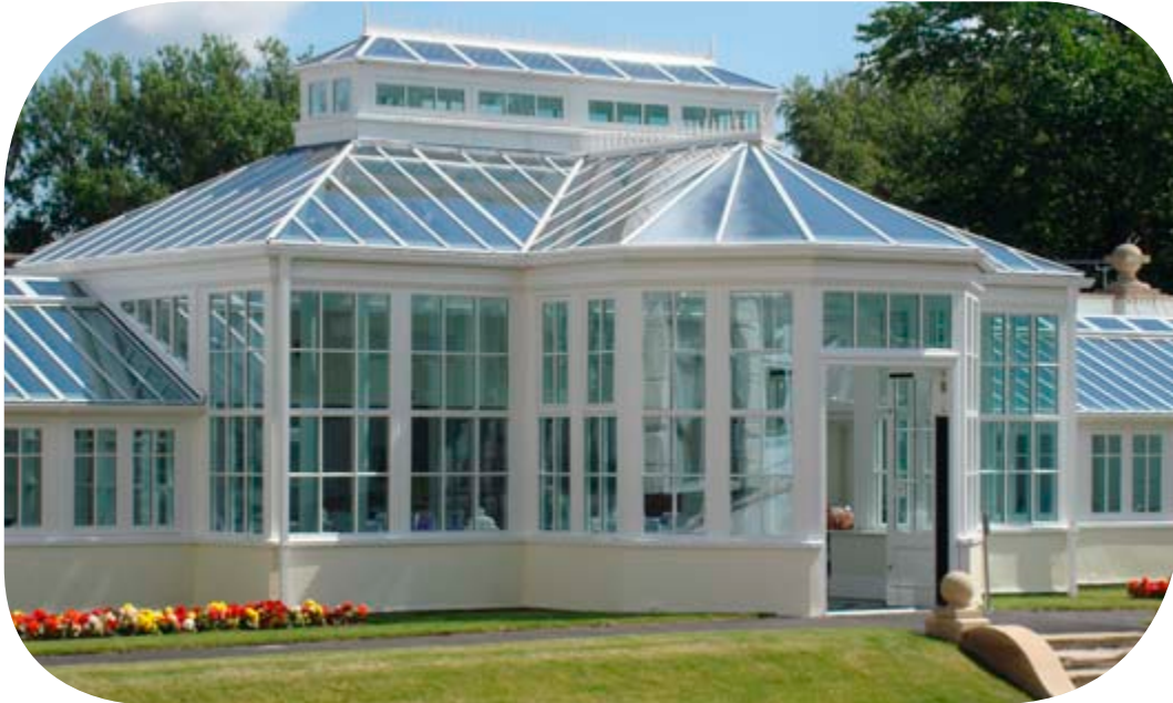
Pilkington Activ SunShade™ Neutral