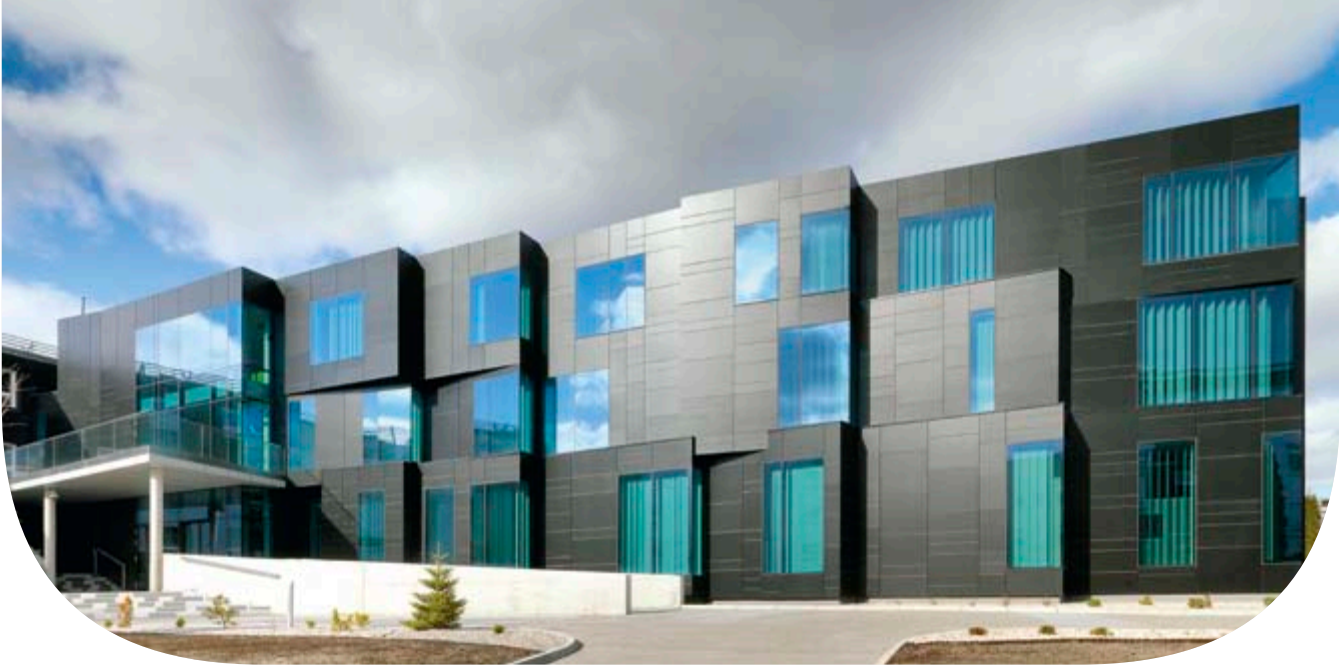
Pilkington Activ™ Blue