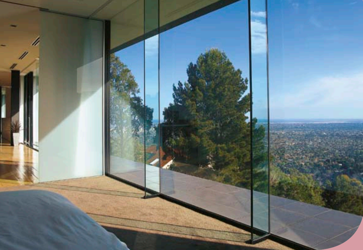
Pilkington Activ ™ Clear