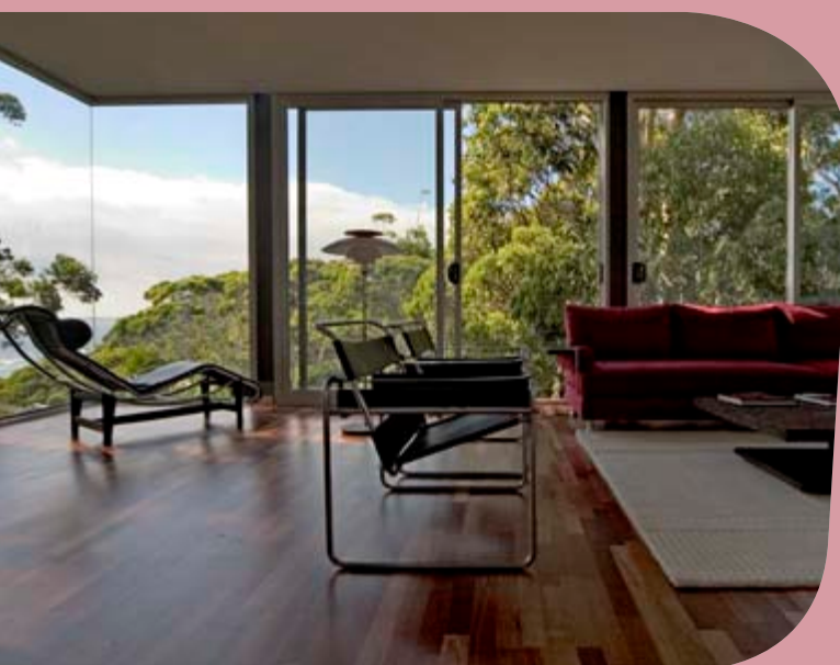
Pilkington Activ ™ Clear