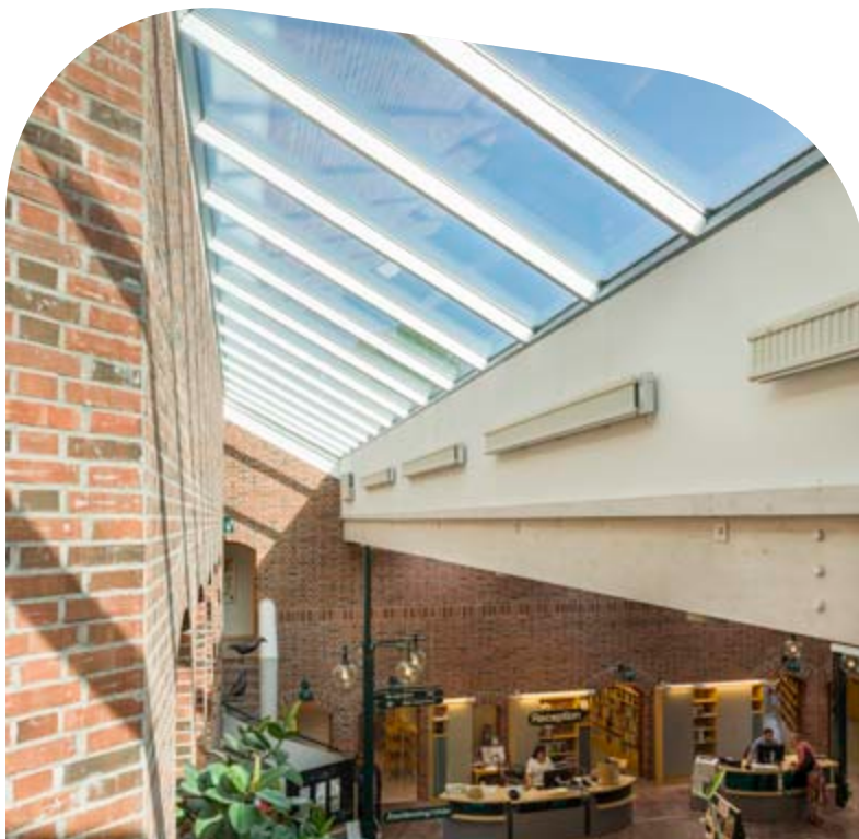
Pilkington Activ Suncool™ 50/25

* Level of reflection: Low reflection < 15%, Medium reflection 15-25%, High reflection > 25%.