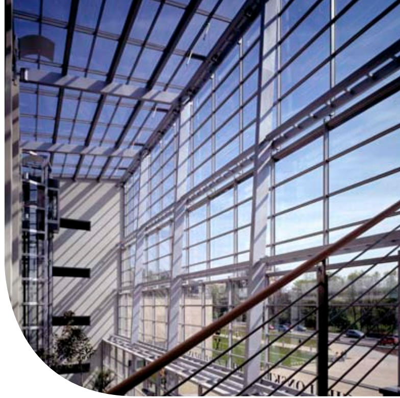
Pilkington Activ ™ Clear

Pilkington Optitherm ™ S3 low-emissivity coating, usually used on surface #3 in insulating glass units, is sometimes difficult