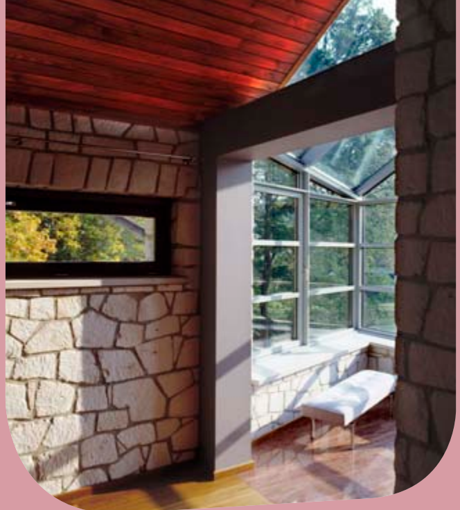
Pilkington Activ Suncool™ 70/40